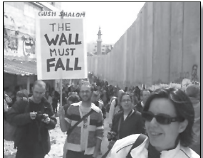
Gush Shalom protest against the separation wall

Finally, Israeli organizations have also worked to support nonviolent Palestinian resistance to the Wall. In the West Bank village of Budrus, Ta'ayush and the new