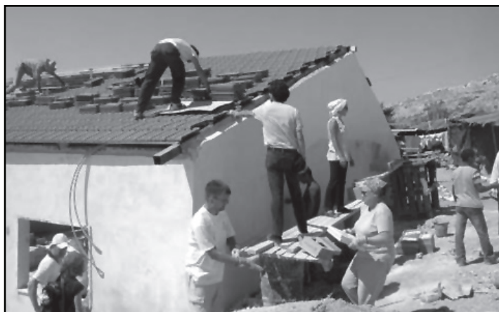
Palestinian, Israeli and international workers and volunteers rebuild a demolished Palestinian home near the Shu’fat refugee camp.

The intifada also inspired the creation of organizations geared towards collecting and disseminating information about the uprising and Israel’s policies in the OPT. The most notable of these organizations are the Alternative Information Center and B’Tselem (Hebrew for “in the image”). Since 1984, the Alternative Information Center has been a joint Palestinian-Israeli organization that combines political activism with the dissemination of information, research and political analysis on the Israeli-Palestinian conflict through materials such as its magazine News from