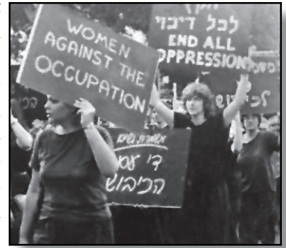
Women in Black march, 1990

Gaza Strip, and East Jerusalem began a widespread, predominantly nonviolent, uprising against the Israeli occupation that was referred to as the intifada (Arabic for "shaking off"). The intifada would last until 1993 and have lasting effects on both Palestinian and Israeli societies.