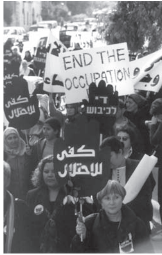
Coalition of Women for a Just Peace march, Jan. 20, 2000.

Within the Jewish Israeli peace movement eight women's peace organizations responded to the intifada by forming the Coalition of Women for a Just Peace . This coalition held the largest Israeli protest against the occupation at the beginning of the intifada in December 2000. The coalition soon refocused their efforts on civil disobedience against the occupation by disrupting Israeli closure policies in the OPT and disrupting the army at checkpoints. This work has been led by Machsom Watch ("Machsom" is Hebrew for checkpoint), which was founded in January 2001 in response to repeated reports in the press about human